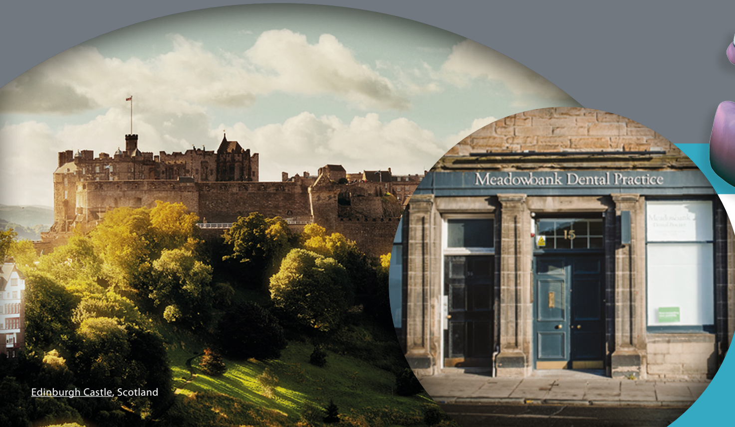
Edinburgh Castle, Scotland

Hotel Leonardo Haymarket & Meadowbank Dental Practice, Edinburgh, Scotland, UK