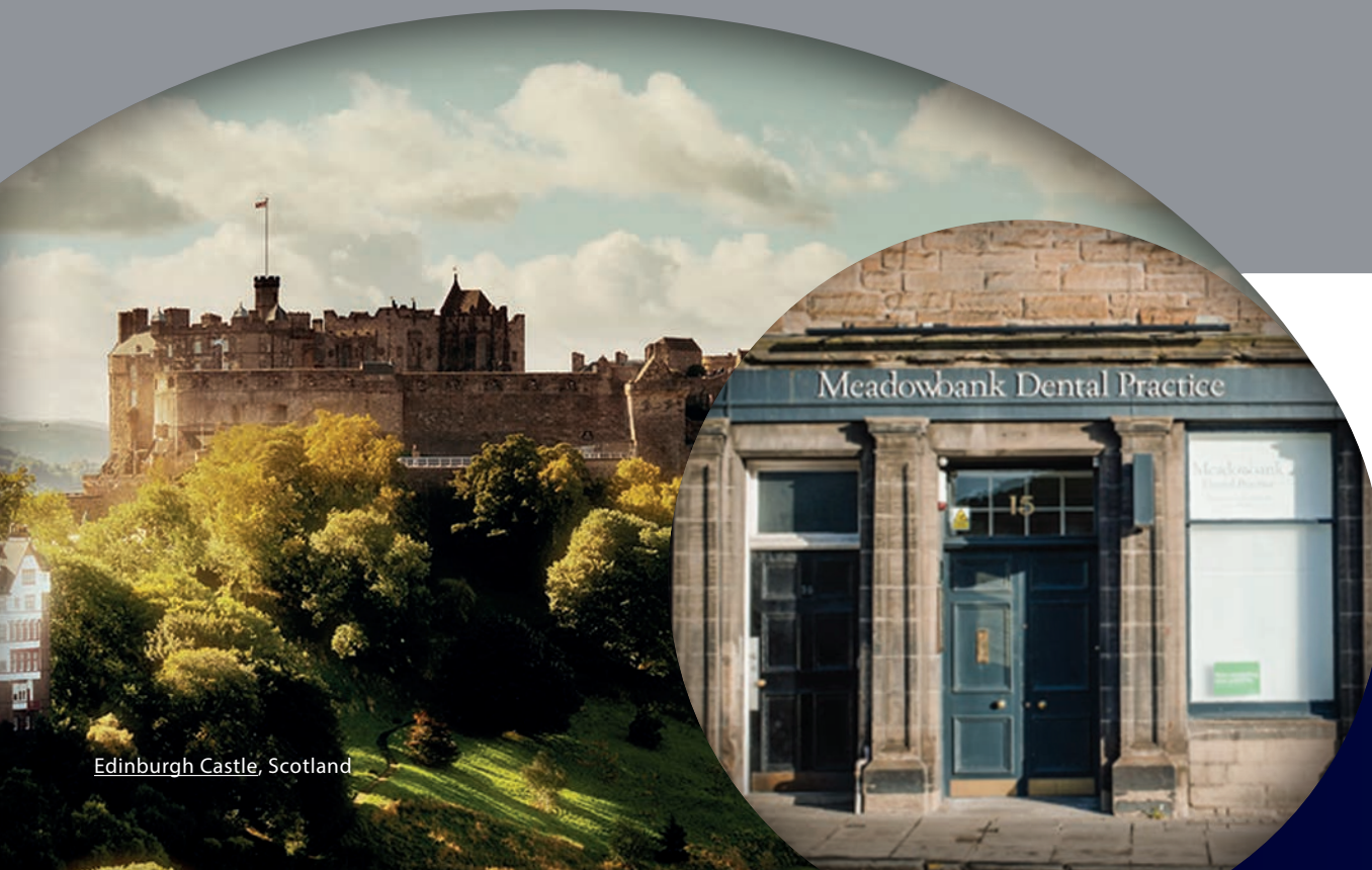
Edinburgh Castle, Scotland

Village Hotel Edinburgh & Meadowbank Dental Practice, Edinburgh, Scotland, UK