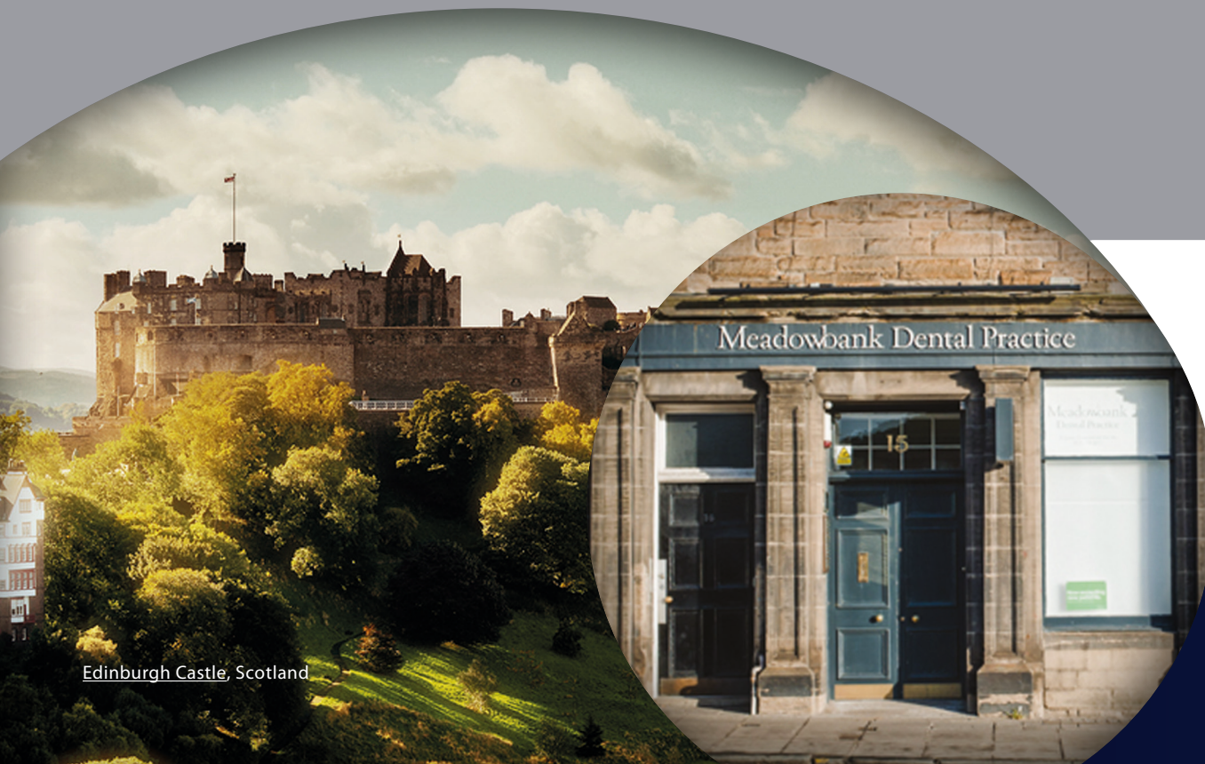
Edinburgh Castle, Scotland

Hotel Novotel Edinburgh Centre & Meadowbank Dental Practice, Edinburgh, Scotland, UK